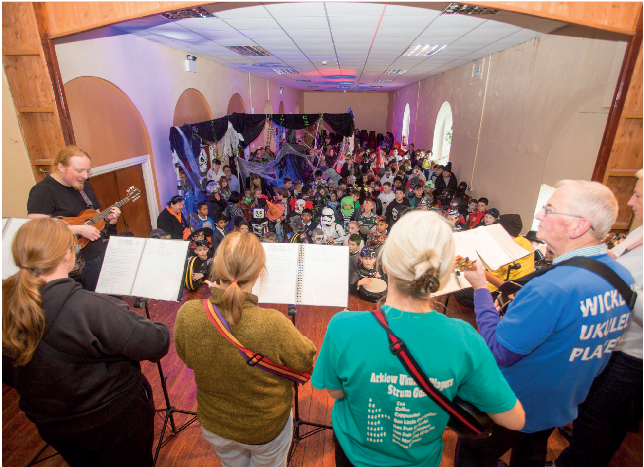
Rathdrum Primary School Creative Programme Celebration.