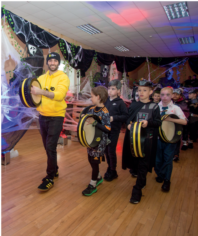
Rathdrum Primary School Creative Programme Celebration.