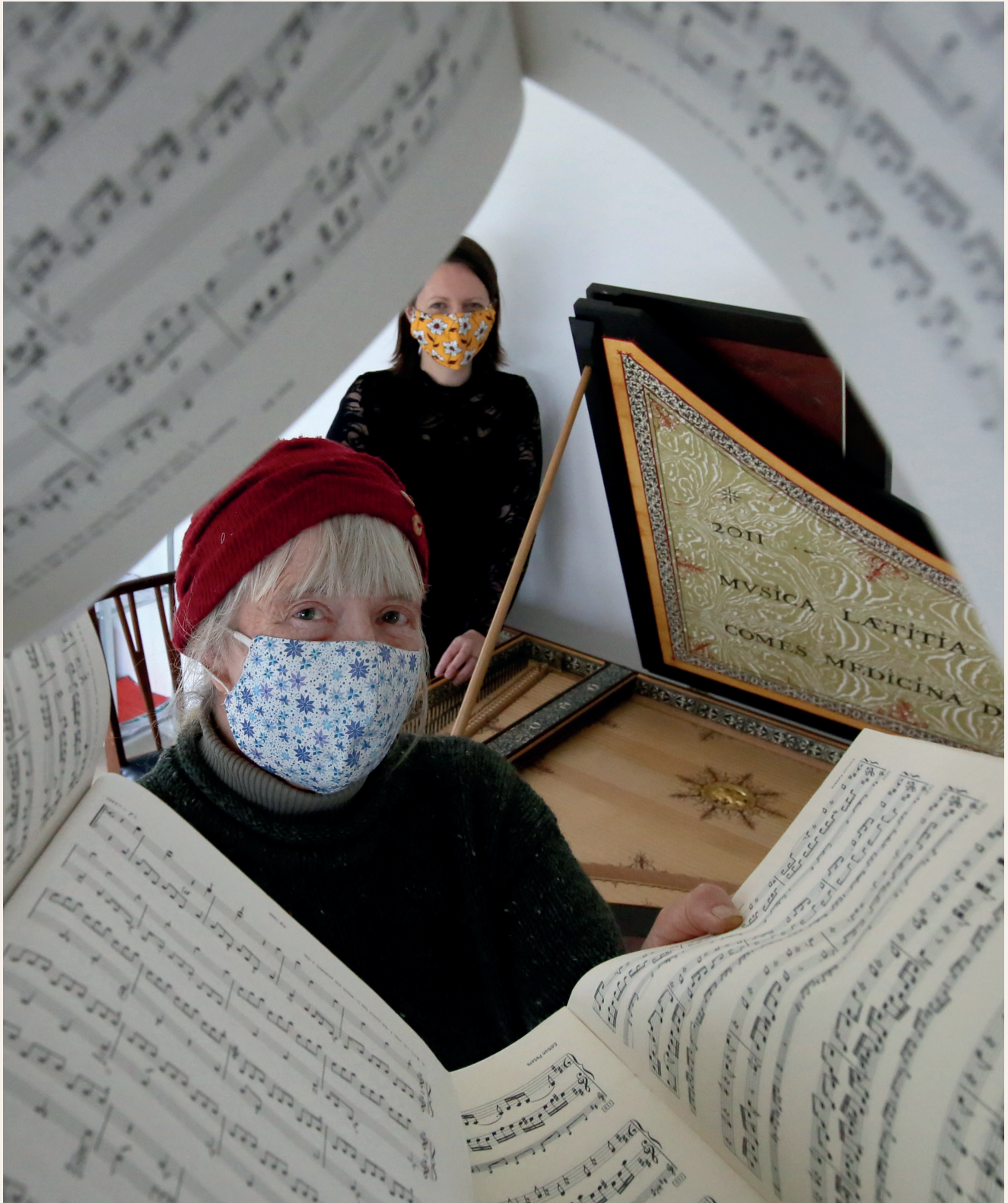
Music Teaching Residency Making Music with Sonamus.